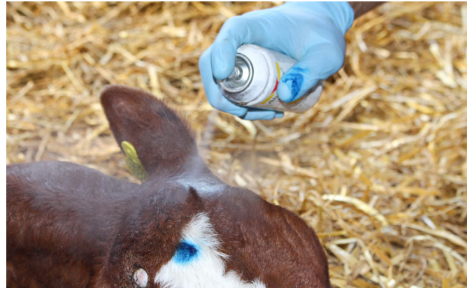
Applying disinfectant spray

Use an antiseptic spray to limit infections and help cool down the cauterized tissues. To improve its cooling effect, the spray can be kept in the refrigerator a few hours before intervention.