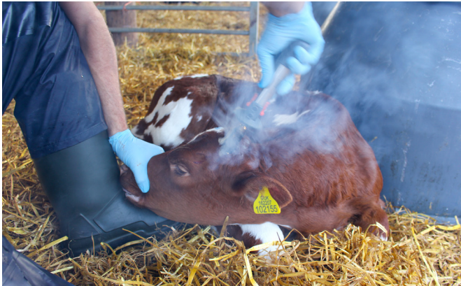
Disbudding using a hot iron