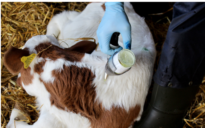
Administering pain relief

Behavioural monitoring of calves has shown the process to be markedly uncomfortable over the following hours and days. The economic impact of the associated reduced feed intake and hence growth rate is well documented. Use of non-steroidal anti-inflammatory drugs helps to reduce the pain associated with disbudding. This helps maintain feed intake making it cost-beneficial tool that also counters some of the stress.