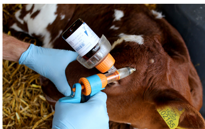
Anaesthetic of the horn bud: find the bony ridge halfway between the eye and the ear.

as the nerve runs alongside the blood vessels. The local anaesthetic is effective within seven minutes of administration. It has a variable length of action, but is reliable for up to one hour. If you are uncertain whether it has worked you can repeat the nerve block after seven minutes. Always check that both horn buds are desensitized before applying the hot iron.