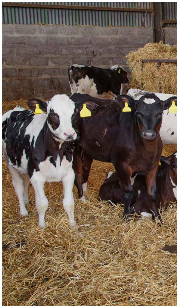
Figure 3. Calves in a straw yard