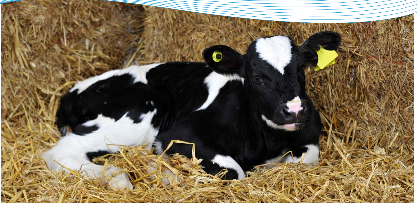
Figure 1. Calf resting in a straw yard