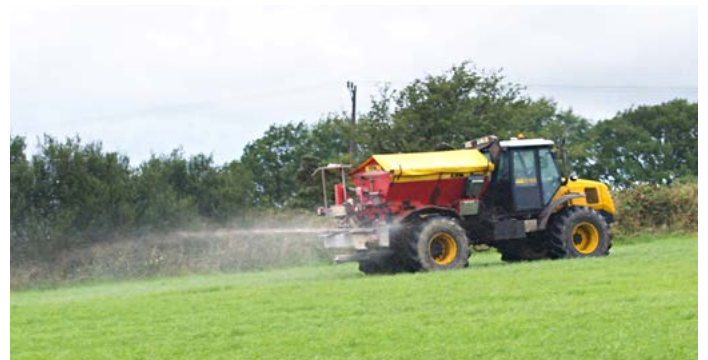
Spinning disk fertiliser spreader

Defra has issued a Code of Good Agricultural Practice to give guidance on actions farmers can take to reduce ammonia emissions.