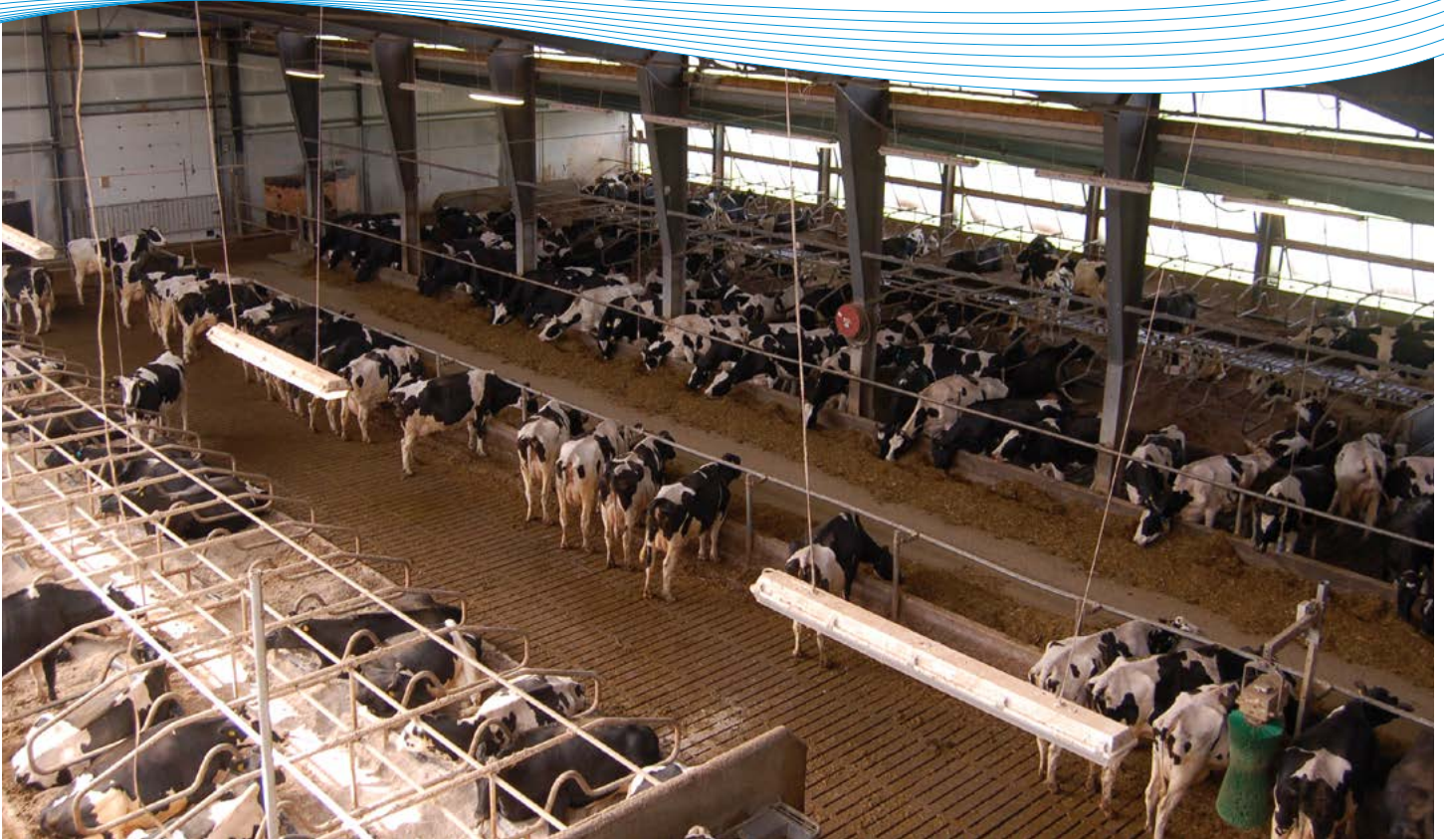
Dairy cow housing is a major source of ammonia