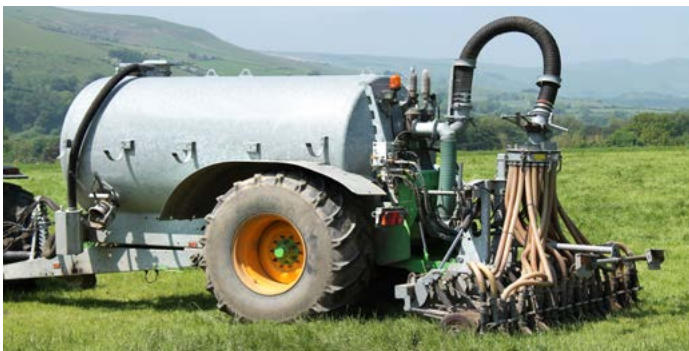
Trailing shoe slurry application (left), dribble bar application (right) and tanker mounted shallow injector (bottom)

Using shallow injection, trailing shoe or dribble bar equipment to spread slurry will reduce this contact and so reduce emissions. Up to 80% of the nitrogen contained in slurry can be lost to the environment when splash plate equipment is used. Shallow injection can reduce ammonia emissions at spreading by up to 70%.