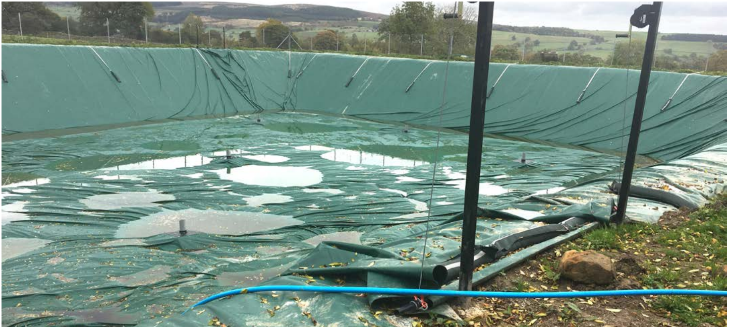
Earth banked lagoon with floating cover