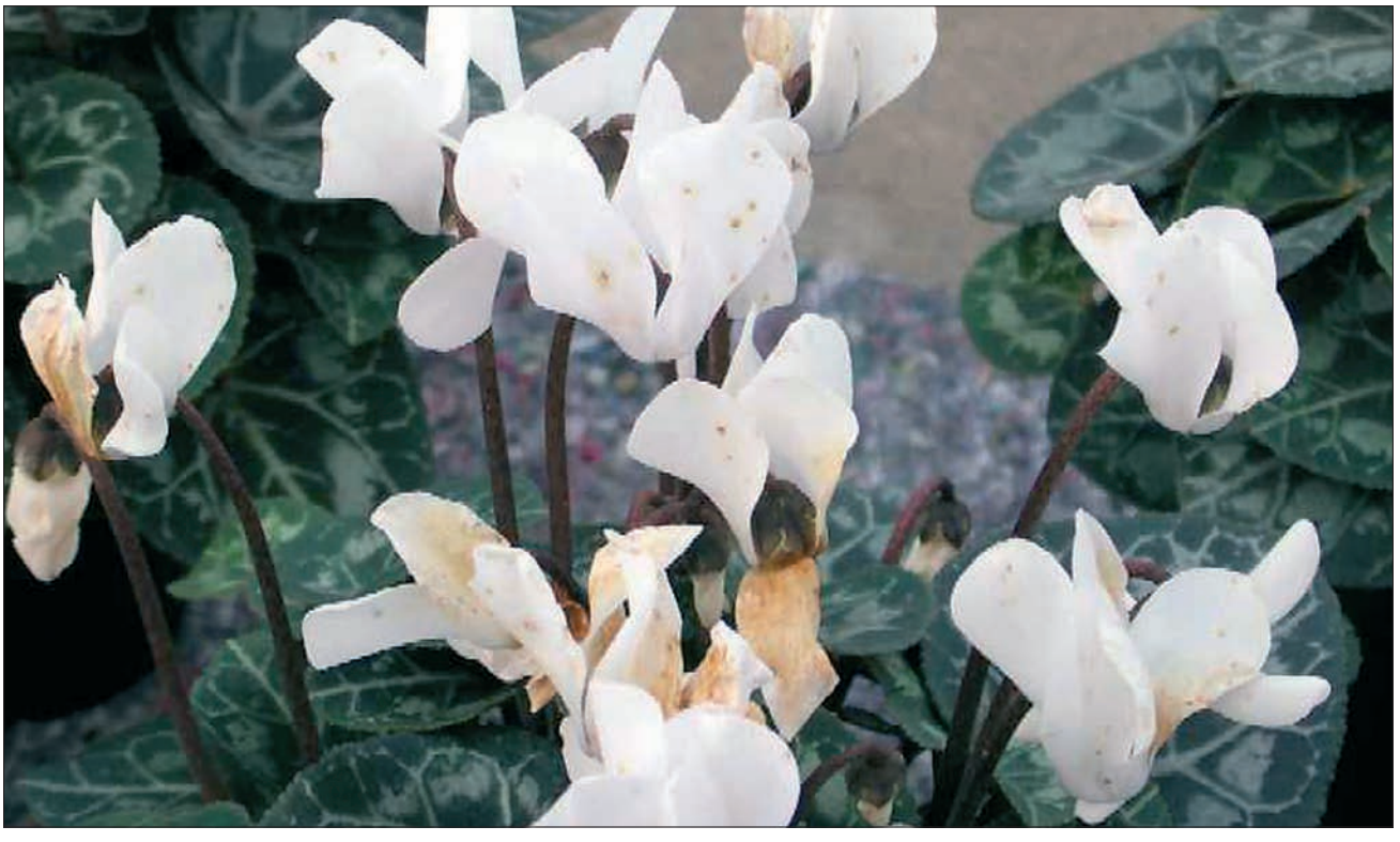
5 Petal spotting and flower damage on cyclamen as a result of botrytis

in tissues and the development of symptoms, were relatively small and differed between species. The clearest effect was that petal spotting on flowers recently inoculated with B. cinerea conidia was greatly influenced by wetness duration (Figures 5 and 6).