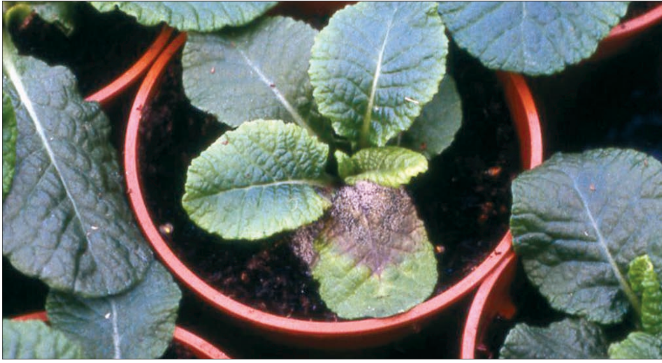
8 Control measures for botrytis on primula are required throughout the production cycle and should include seed as a possible infection source