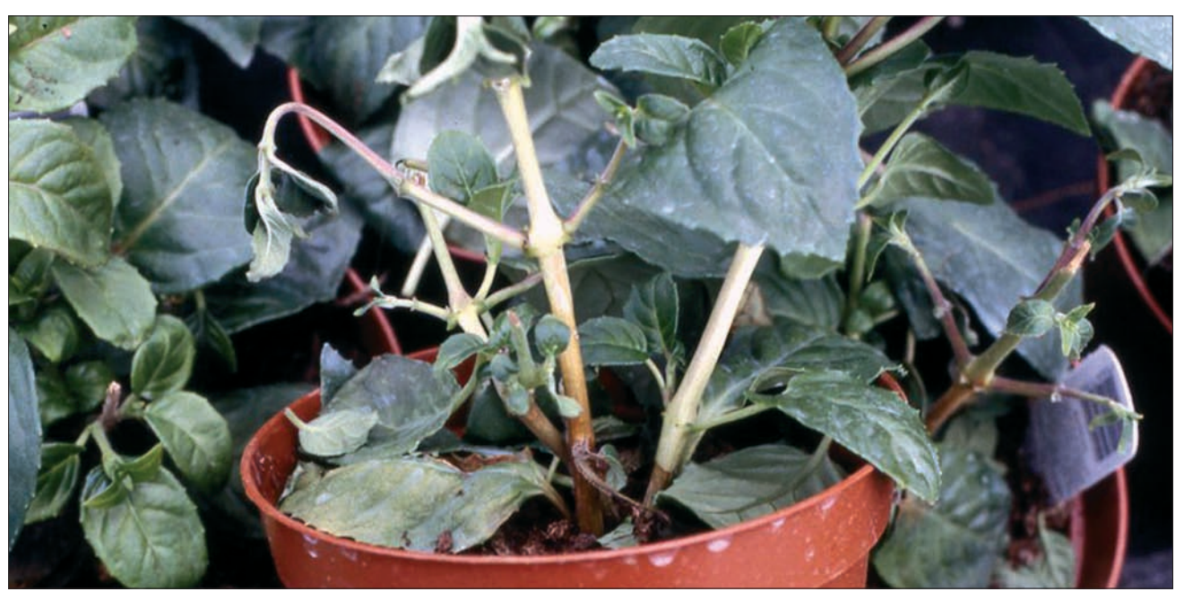
7 A low relative humidity reduces the risk of botrytis leaf and stem rot in fuchsia