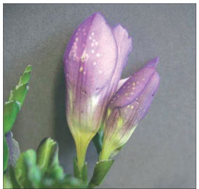
3 Infection by B. cinerea causes spotting on freesia