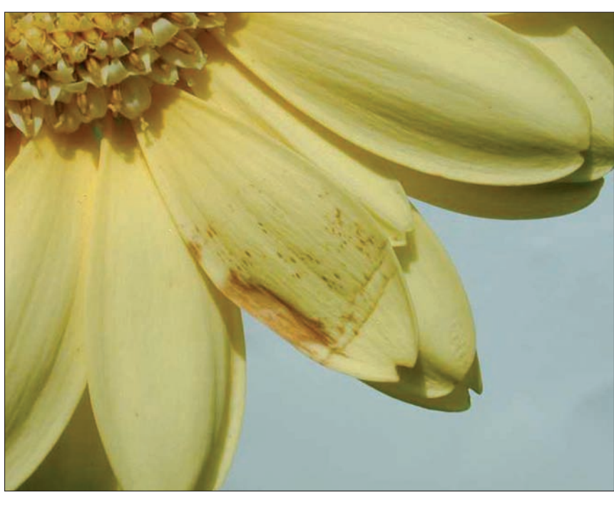
4 Some varieties of gerbera contaminated with botrytis spores develop petal spotting after just 1 hour of flower wetness

Matthiola Ageratum Antirrhinum Nicotiana Calendula Pelargonium Chrysanthemum Phlox Cyclamen Primula Dianthus Senecio Gerbera Viola Helianthus Wallflower Lobelia 7innia Lupinus