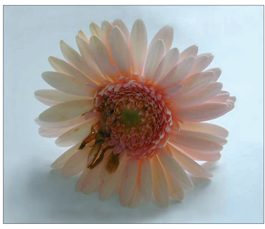
1 Rejection of gerbera due to botrytis results in wastage of other lines included in mixed bouquets

The annual wastage of cut flowers and pot plants in the UK resulting from symptomatic botrytis development from product rejection at nursery dispatch or the packhouse, in store or from returns to stores is estimated to be £24 million. Where a botrytissusceptible species is used in a mixed bouquet, development of botrytis on that single species results in wastage of the whole bouquet (Figure 1). Products that have suffered from serious post-harvest botrytis wastage in recent years are listed in Table 1 (overleaf).