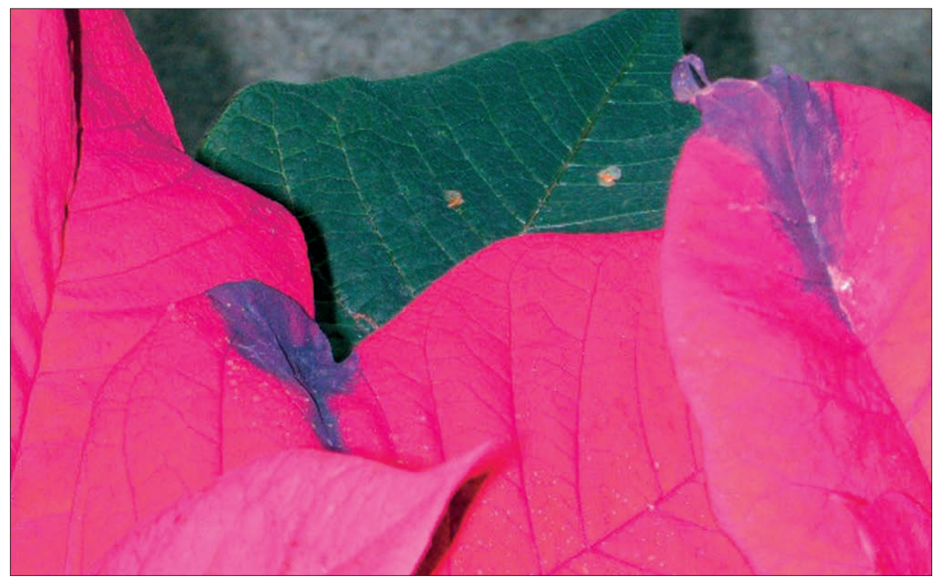
6 Purple lesions on poinsettia following botrytis infection of wet bracts