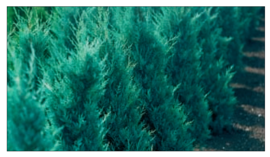
9 Conifer hedges are suitable for mechanical trimming to produce numerous cuttings

Subjects such as Berberis , Chaenomeles , Cotoneaster , Euonymus , Lavendula , Potentilla , Pyracantha , Spireae and many conifers can be grown in hedgerows and pruned annually using mechanical hedge trimmers to produce numerous, evenly sized shoots which can be quickly harvested for use as cuttings. Vigorous varieties can be cut back by at least half each year. Less vigorous subjects such as Buxus , Eleaegnus and Cornus need only a lighter trim.