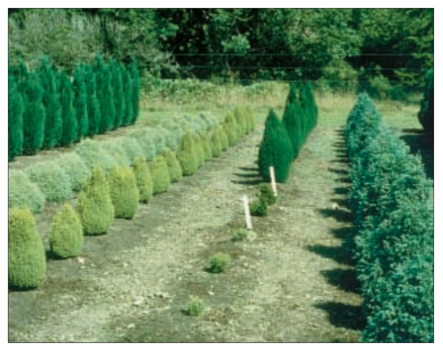
1 Use clonal stock plants to optimise uniformity and propagation performance

Ideally, harvest soft and semi-ripe cuttings in the morning when conditions are cool. Store in shallow boxes/trays or white polythene bags at 4°C and 90% relative humidity. Use the material quickly and avoid long term storage.