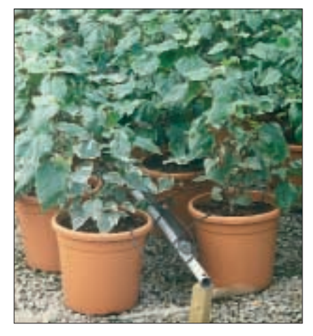
5 Adequate irrigation during the season ensures cutting material is in optimum condition for propagation: field irrigation equipment (left) trickle irrigation of stock plants (right)