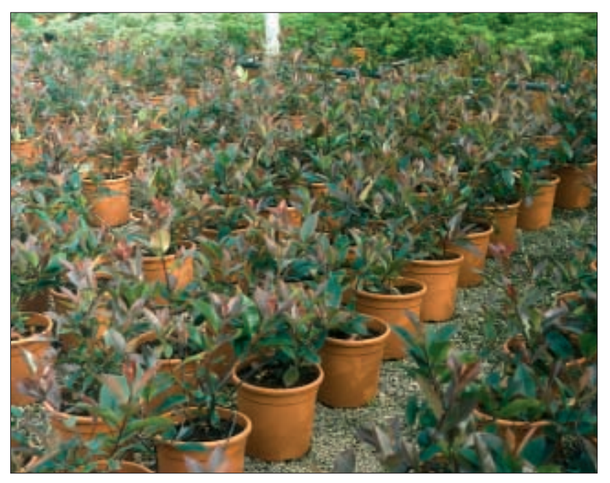
4 Container grown stock plants provide flexibility and are particularly useful where regular and timely supplies of cuttings are required

These provide flexibility, allowing plants to be grown either outdoors or under protection in different environments to control growth. This is particularly useful for scheduled production systems that require regular supplies of cuttings. Space requirements and soil type suitability are further considerations when choosing between field or container grown stock plants which, ideally, should also be within easy reach of the propagation unit to ease and speed handling.