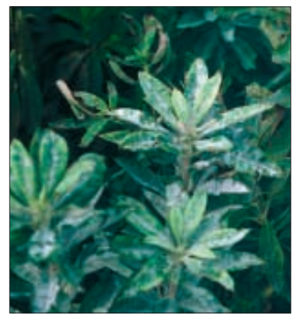
7 Treat promptly or remove stock plants with problems such as powdery mildew