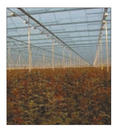
11 Supplementary lighting can be used to improve cutting yield and quality

HDC projects HNS 42 & 42a 'Supplementary lighting for alpines, herbaceous and hardy nursery stock species' showed heather cultivars to be particularly responsive in terms of controlling stock plant growth to provide early batches of cuttings. Also, the growth of early flushing cultivars of Clematis stock plants was advanced allowing cuttings to be taken a month earlier than usual. Several herbaceous and alpine species were also shown to be responsive to lighting, for example Primula auricula, Phlox and Helianthemum .