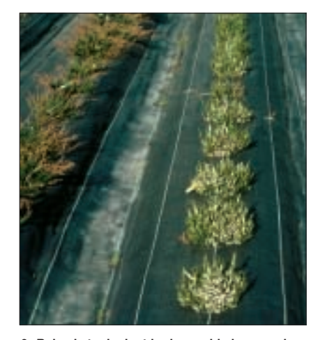
6 Raised stock plant beds provide improved drainage for moisture sensitive subjects and permeable mulches provide weed control and conserve soil moisture