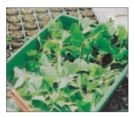
2 Stock plants should provide sufficient healthy, high quality, true-to-type plant material

managed and stock plants under protection forced as necessary for early cuttings.