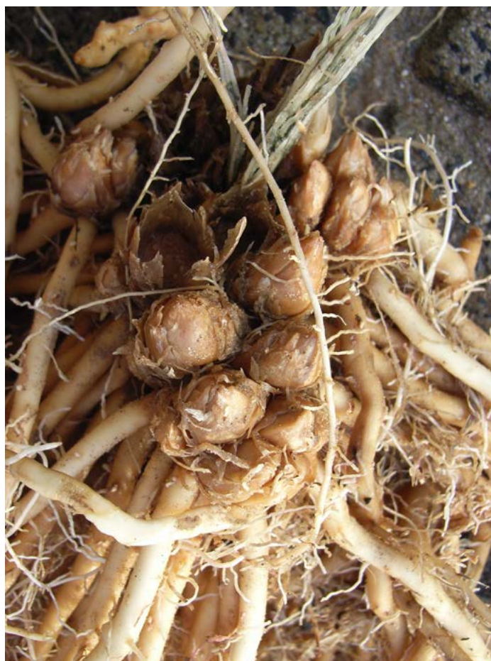
Asparagus crown consisting of rhizome, bud clusters, buds, fleshy storage roots and fine feeder roots

For more detailed information on the project, see the final report, which is available on the AHDB website.