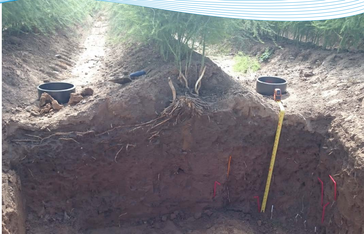
Figure 1. Asparagus root architecture exposed