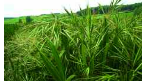
ALS-insensitive populations have been detected in multiple species of brome and both EMR and target site mechanisms have been confirmed.

“Blackgrass is a cross-pollinating species so there’s a propensity for genetic diversity in the population, whereas bromes are predominantly self-pollinating, with just a small degree of out-crossing. That means that resistance is likely to develop much more slowly in bromes than in blackgrass.