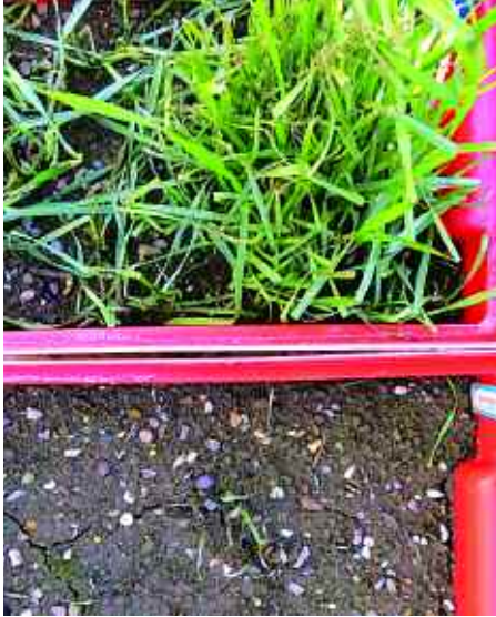
Container trials were used to determine the efficacy of different modes of action on different brome species and populations.

► at this rate. All populations were well controlled by 540g/ha of glyphosate — the recommended field rate for annual grassweeds.