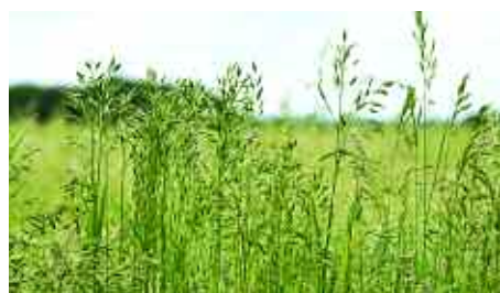
The ‘soft’ brome species – rye brome, meadow brome and soft brome – can be particularly hard to identify.

Sterile brome was found to be the most common species in the UK — with the North, South-East, West Midlands and South West the worst affected areas. It also