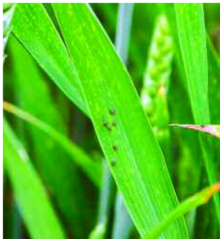
The bird cherry-oat aphid and grain aphid are the key culprits in BYDV transmission.