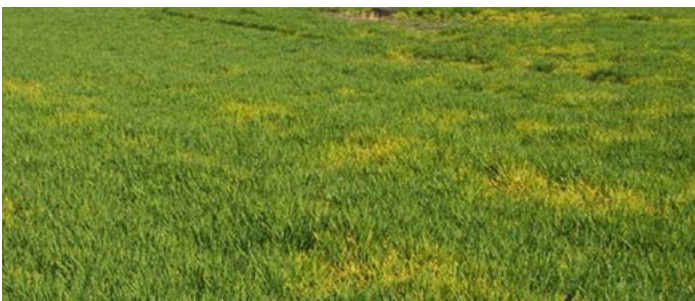
Figure 2. Symptoms of barley yellow dwarf virus