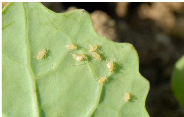
Figure 7. Peach-potato aphid ( Myzus persicae )

The peach-potato aphid ( Myzus persicae ) is the main vector of TuYV, although other aphid species can be vectors. The virus is transmitted to oilseed rape in the autumn, when peach-potato aphids migrate into crops. These aphids are normally found on the underside of leaves.