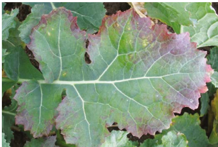
Figure 6. Symptoms of turnip yellows virus in oilseed rape