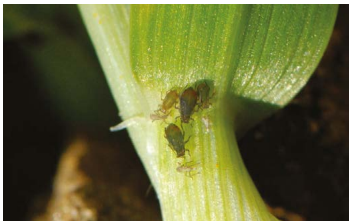
Figure 4. Bird cherry-oat aphid ( Rhopalosiphum padi )

Bird cherry-oat aphid is a host-alternating species. In autumn, relatively high numbers fly to the primary host (bird cherry trees) to overwinter. In mild conditions, a proportion of the population continues to reproduce asexually in cereals and grasses, increasing the virus transmission risk. This species first colonises the lower leaves and stems of plants.