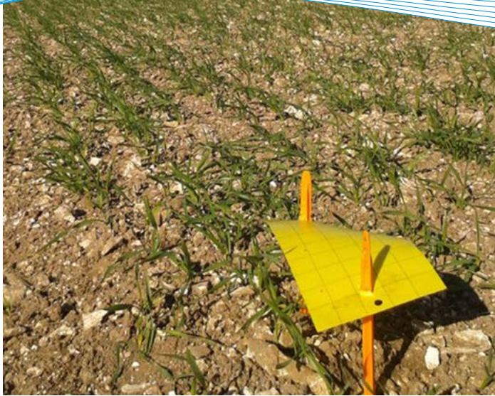
Figure 1. Yellow sticky trap

The transmission of viruses to cereals and oilseed rape by aphids is the focus of this publication. Some soil-borne vectors can also transmit viruses. These are described in the AHDB Encyclopaedia of cereal diseases.