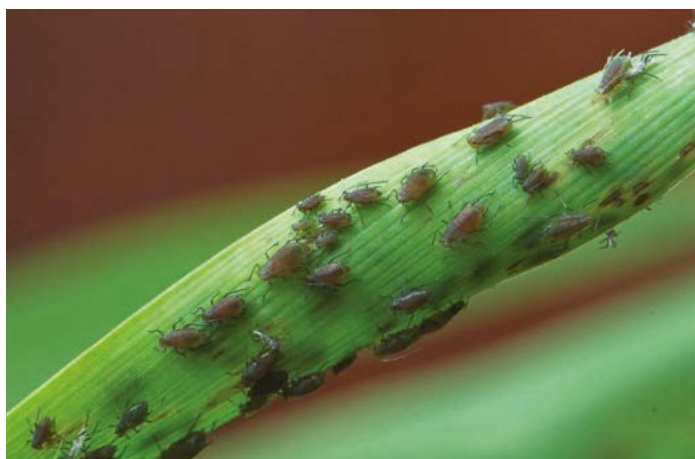
Figure 5. Grain aphid ( Sitobion avenae )

Grain aphid is a non-host alternating species. This means it overwinters in cereals and grasses. Relatively low numbers fly in the autumn. As populations overwinter on cereals, they can increase rapidly on crops in spring. This species first colonises the flag leaf and upper leaves of plants. Grain aphid is also a vector of Potato virus Y (PVY), which affects potato crops.