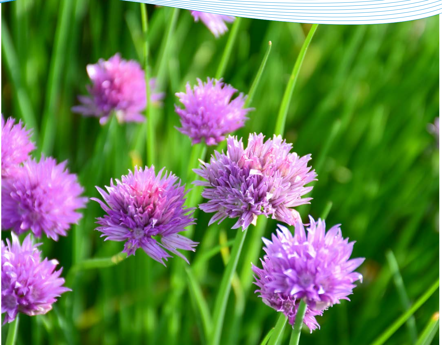
Figure 1. Ensure that chives have adequate amounts of sulphur for good flavour development