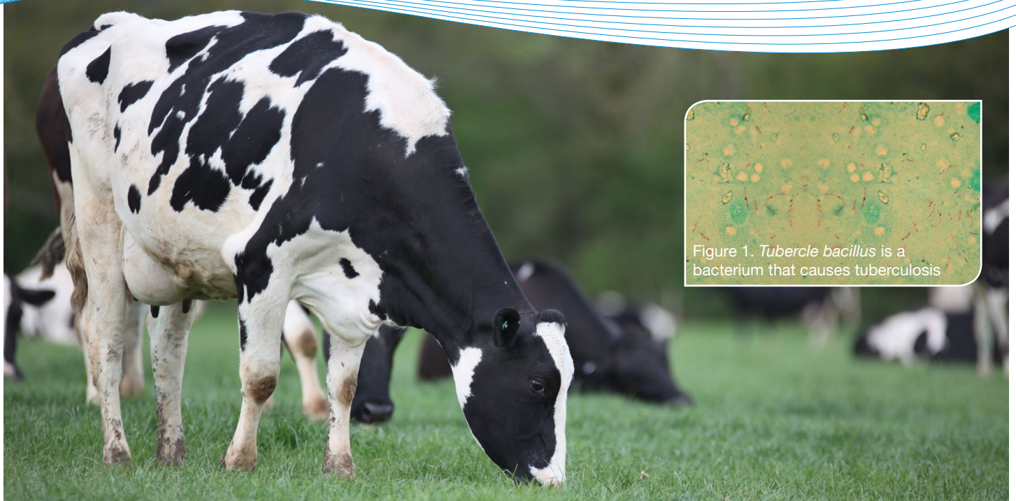
Figure 1. Tubercle bacillus is a bacterium that causes tuberculosis