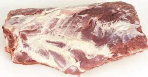
1 Collar of Pork – bone-in.