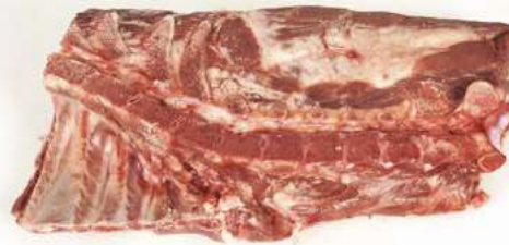
2 Collar of Pork – bone-in.