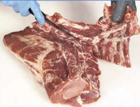
4 ... taking care not to cut into underlying muscles.