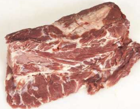
5 Collar – boneless.