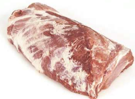
6 Collar – boneless.