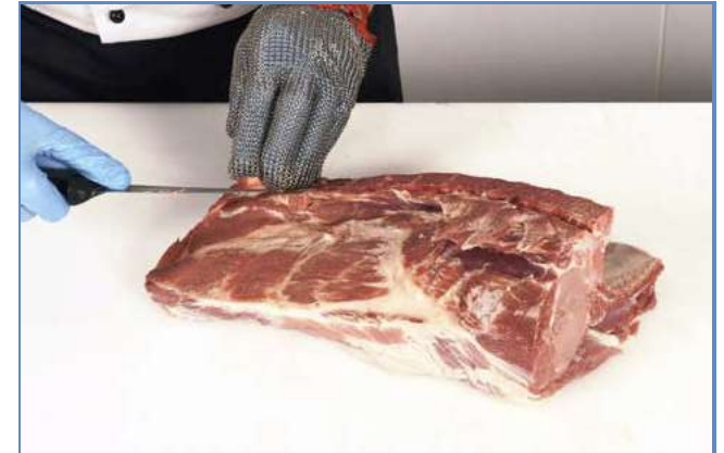
3 Remove the bones by sheet boning ...