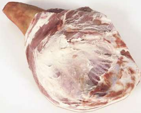
1 Shoulder – Round.