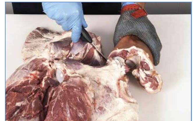
6 Remove the shank and ...