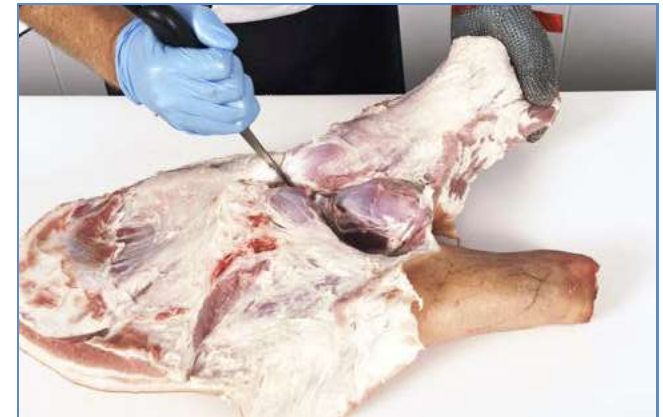
3 ... back to expose the humerus.