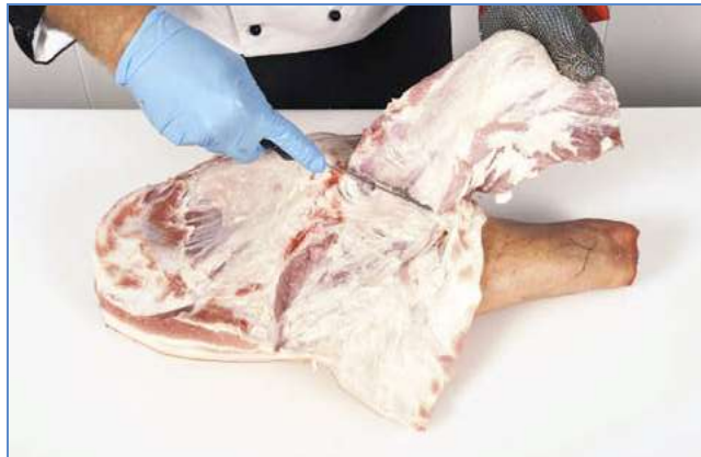
2 Seam cut the brisket muscle and fold it ...