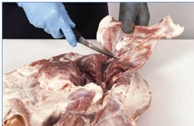
5 ... and remove the blade bone.