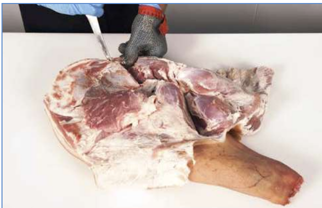
4 Follow the contours of the shoulder blade ...