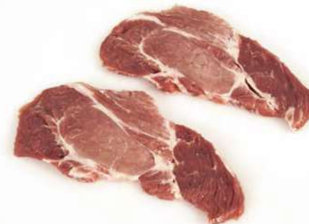
3 Thin Cut Collar Steaks.