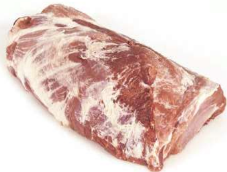
1 Boneless Collar.