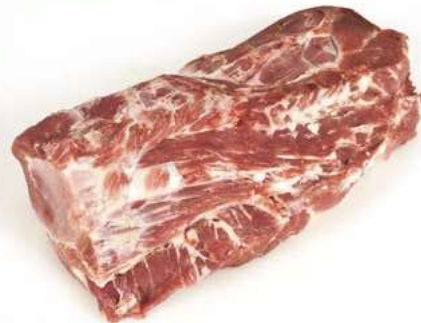
2 Trim of excess fat. Temper the collar to -2^{\circ}\text{C} before slicing into 5–7 mm thick steaks.