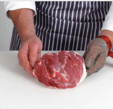
5. Topside (internal view).