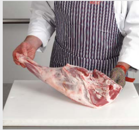
2. Leg and chump.