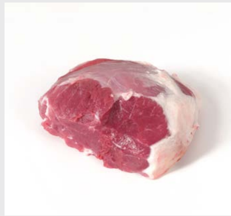
6. Topside (external view). Maximum fat thickness 5mm.