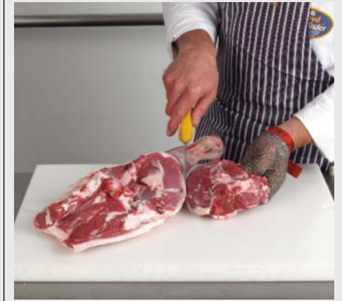
4. Separate topside muscles by following the natural seam.