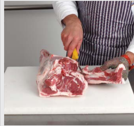
3. Remove aitch, back and tailbones.