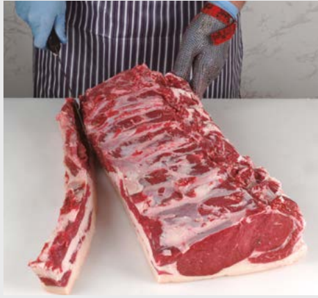
2. Remove the bones by sheet boning technique. Remove the tail by cutting 25mm from the tip of the eye muscle