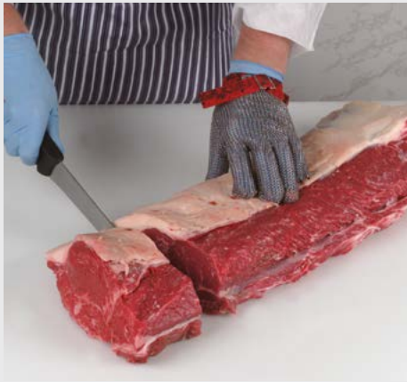
5. Remove the D muscle from the rump end of the loin as illustrated.