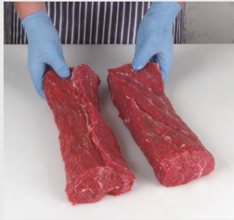
8. into two, lengthways.