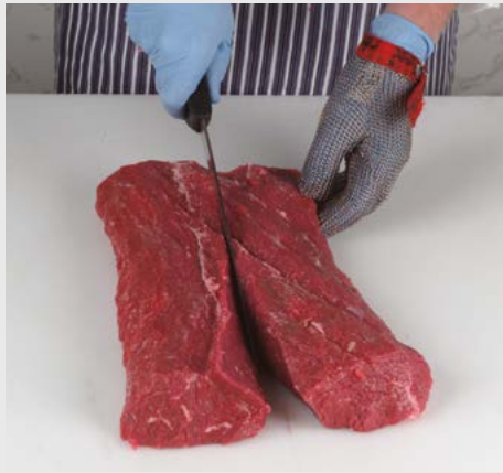
7. Cut the eye muscle of the sirloin...