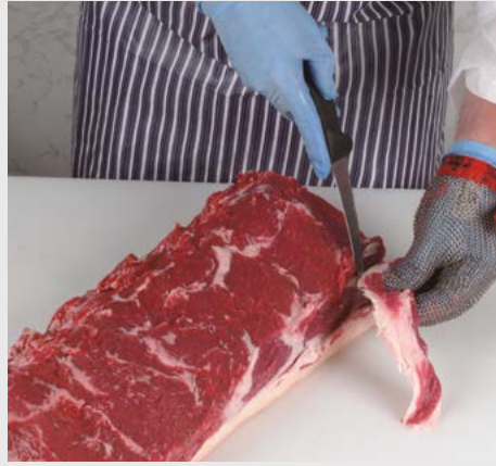
4. and fat from the internal side.