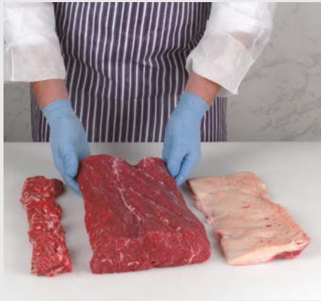
6. Remove chain and external fat.