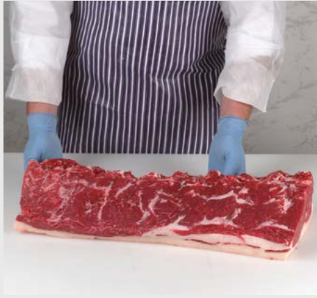
3. Trim all gristle, connective tissue...