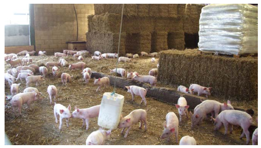
Weaners with straw and suspended plastic object

Many producers introduce some of the items listed in this section to their straw housed pigs even when they appear comfortable and settled. Stimulating interest and providing an activity for pigs is a useful way to enable them to express natural behaviour. Varying the objects on a weekly basis also provides novelty.