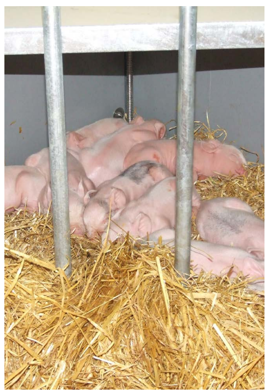
Example of straw being used for piglets in farrowing crates