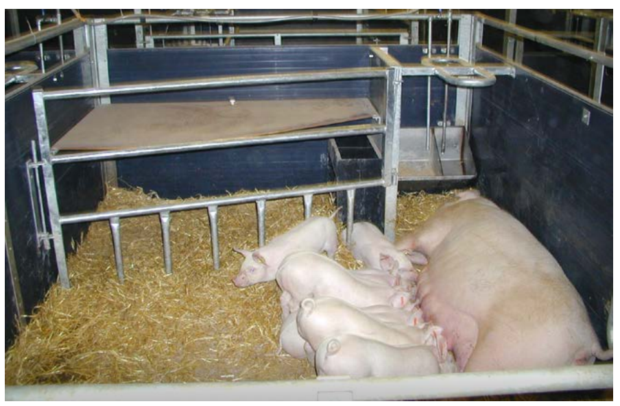
Individual farrowing pen with straw

Producers can introduce some of the items listed in this section to their stock housed on straw even when they appear comfortable and settled. Stimulating interest and providing an activity for pigs is a useful way to enable them to express natural behaviour. Varying the objects on a weekly basis also provides novelty.