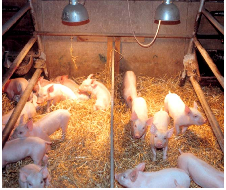
Example of straw being used in the piglet creep area of a farrowing crate