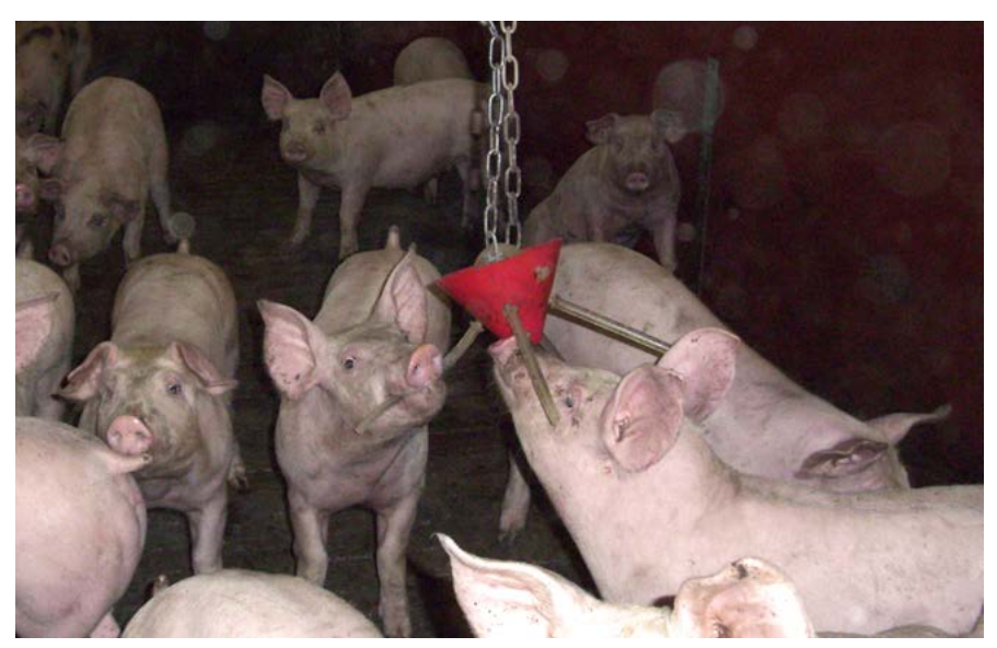
Growers with a commercially available plastic toy - Bite Rite™

Stimulating interest and providing an activity for pigs is a useful way to enable them to express natural behaviour. Varying the objects on a weekly basis also provides novelty.