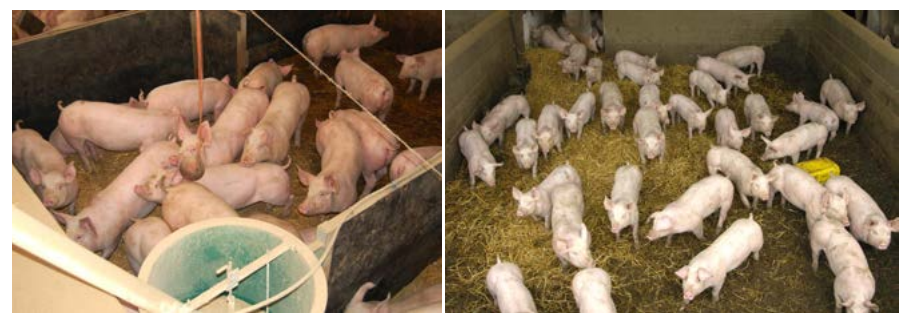
Finishers on straw with a suspended plastic toy or plastic object at floor level

Many producers introduce some of the items listed in this section to their straw housed pigs even when they appear comfortable and settled. Stimulating interest and providing an activity for pigs is a useful way to enable them to express natural behaviour. Varying the objects on a weekly basis also provides novelty.