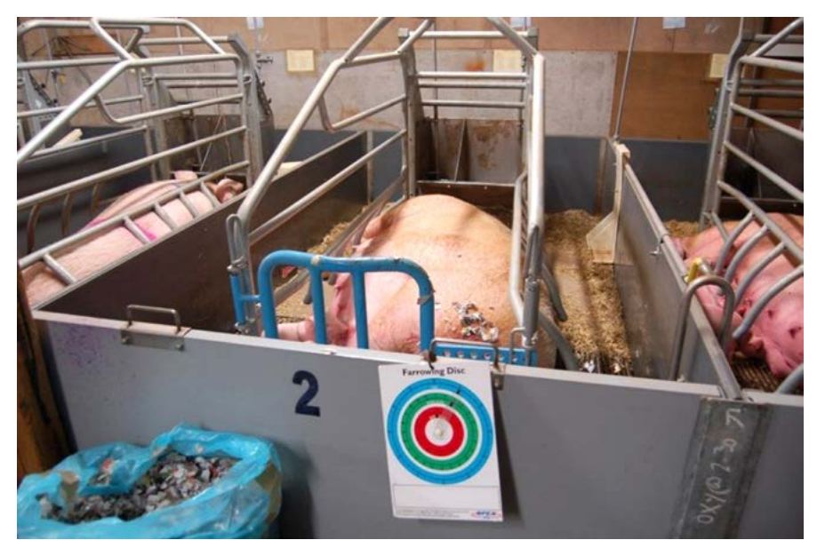
Shredded paper and straw being used for sows in farrowing crates