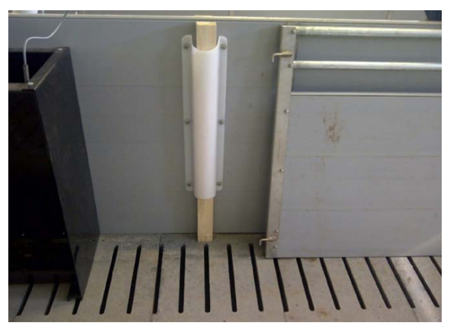
Example of wood in a holding tube, mounted on a pen wall

Stimulating interest and providing an activity for pigs is a useful way to enable them to express natural behaviour. Varying the objects on a weekly basis also provides novelty.