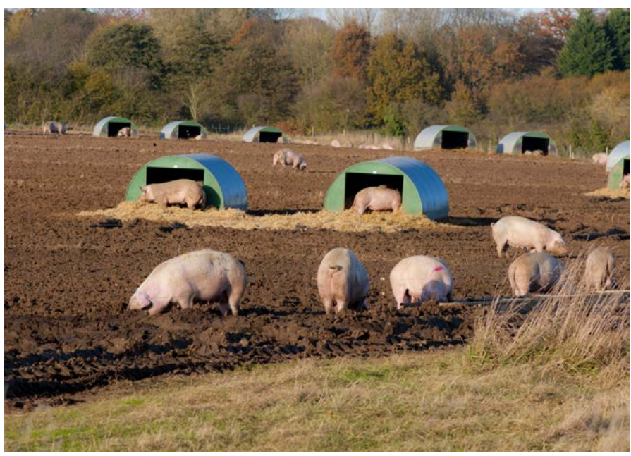
Outdoor dry sows, with straw for bedding in huts

Producers can introduce some of the items listed in this section to their stock housed outdoors even when they appear comfortable and settled. Stimulating interest and providing an activity for pigs is a useful way to enable them to express natural behaviour. Varying the objects on a weekly basis also provides novelty.