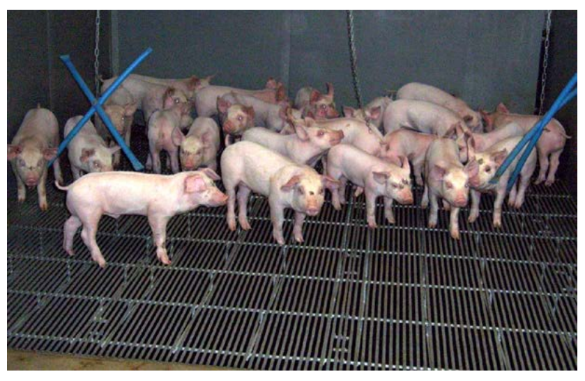
Weaners on slats with plastic piping suspended from chains are marginal enrichment and should be complimented by optimal or suboptimal materials

Stimulating interest and providing an activity for pigs is a useful way to enable them to express natural behaviour. Varying the objects on a weekly basis also provides novelty.