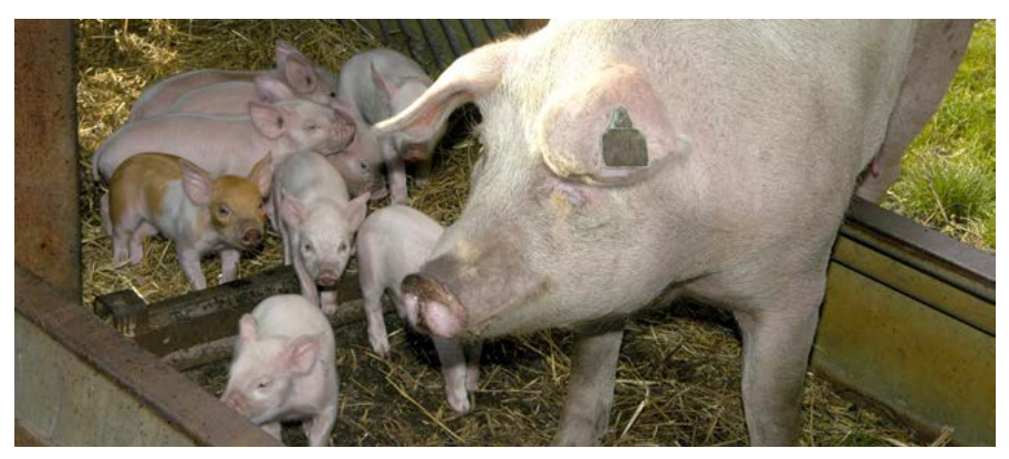
Outdoor farrowing huts in a paddock

Producers can introduce some of the items listed in this section to their stock housed outdoors, even when they appear comfortable and settled. Stimulating interest and providing an activity for pigs is a useful way to enable them to express natural behaviour. Varying the objects on a weekly basis also provides novelty.