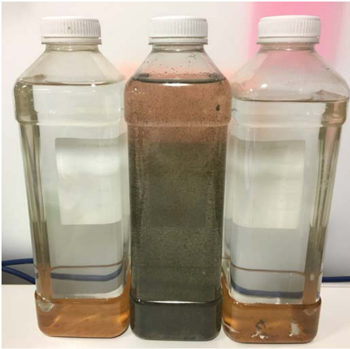
Figure 3. Iron deposits in water samples