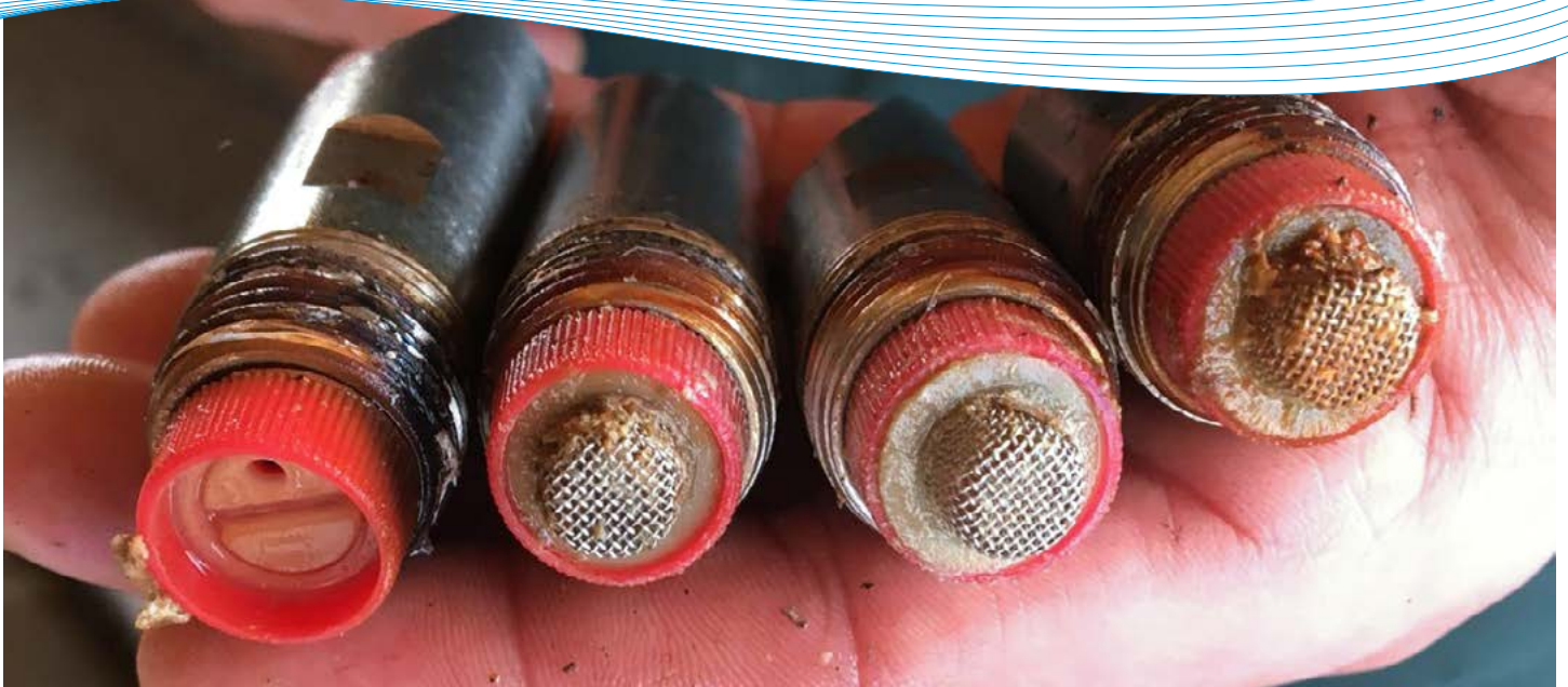
Figure 1. Sediment blocking nipple drinker filters