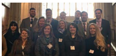
Next Gen take on Westminster