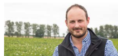
Meet your regional manager