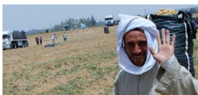
Egyptian assurance on seed exports